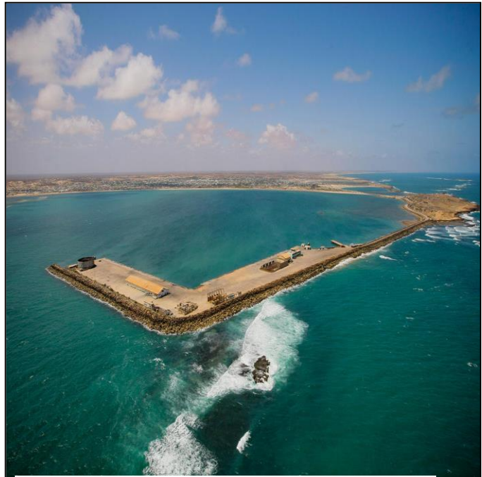
Kismayo Port, Jubaland State of Somalia

1983, the Jubaland share of cattle export through Kismayo was 17 percent whereas camel share was 43 percent; however, this numbers went up as the embargo of Saudi Arabia was lifted. "Cattle have taken over an ever more important share of the live export trade, constituting more than 43 percent of the total tropical livestock units (TLSS) exported in 1982, the best year for livestock exports in Somalia's history. That year, cattle counted for