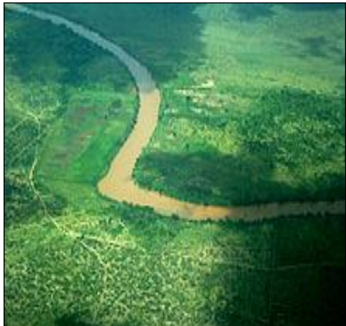
Juba River near Jilib, Jubaland State of Somalia

More than bringing needed capital, labor, and know-how, the people in the Region should stay above divisive and toxic clan squabbles. Unlike, Puntland, Khatumo, or other regional administrations, Jubaland is a diverse region; however, this diversity can be both a blessing and a curse. It can be a blessing because the diversity of the people will result in political and economic vibrancy by different communities. It could be a curse that can unfortunately create division and distrust amongst the communities, akin to silos of clans that do not cooperate and lose the synergy the Region needs to rebuild. While it is a tall order, however, it is in their best interest to build Jubaland in