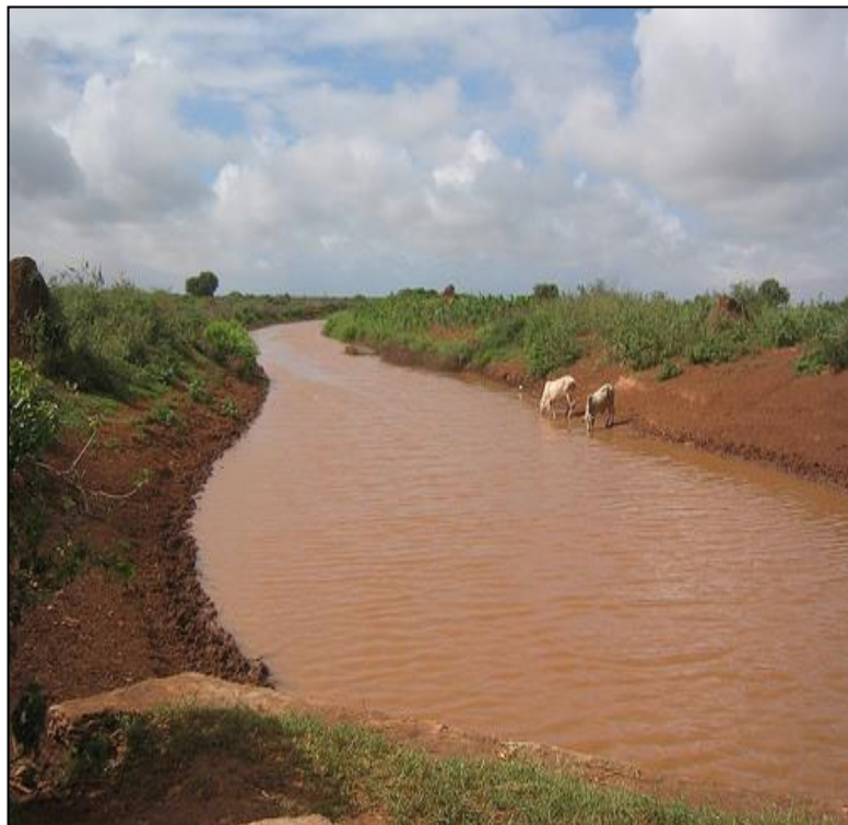
Juba River in Gedo, Jubaland State of Somalia

Finally, it is up to the people of the region to come to terms that they are the only people who can make or break the future of Jubaland. It is critical and hoped that the Jubaland people will commit to, without hesitation, to the best path forward of self-governance in a process that is fair, transparent and equitable in sharing the administration of the state. Without commitment to a model of good governance and equitable power sharing, it is certain that Jubaland will falter. If the residents of