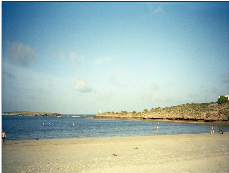
Lido Beach Kismayo, Jubaland State of Somalia (1993)

It is to the benefit of greater Somalia to have stable administration based on the natural desires of the people