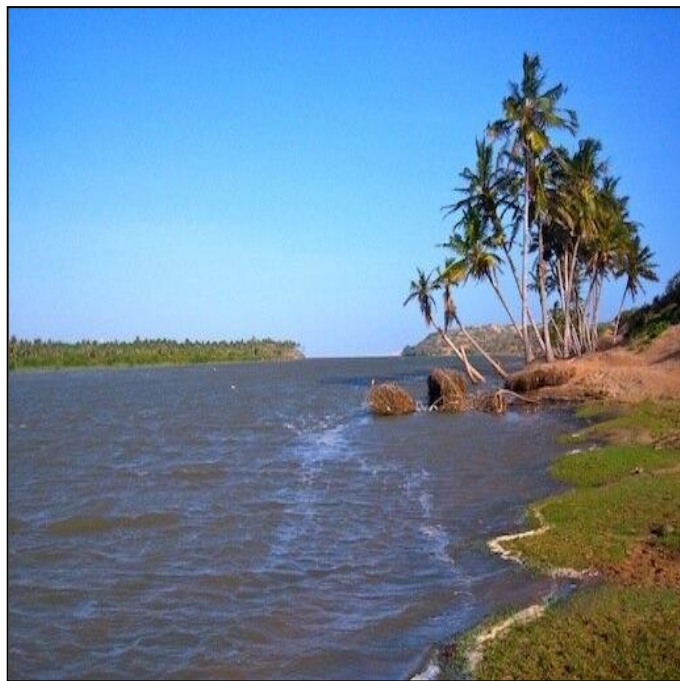
Juba River Meeting Indian Ocean near Gobwein, Jubaland

Furthermore, the three regions (Lower Juba, Middle Juba, and Gedo) that make up Jubaland are very diverse and their model could be used as a blue print for the rest of Somalia. For example, the process that culminated in the creation of Jubaland has been in the works for over four