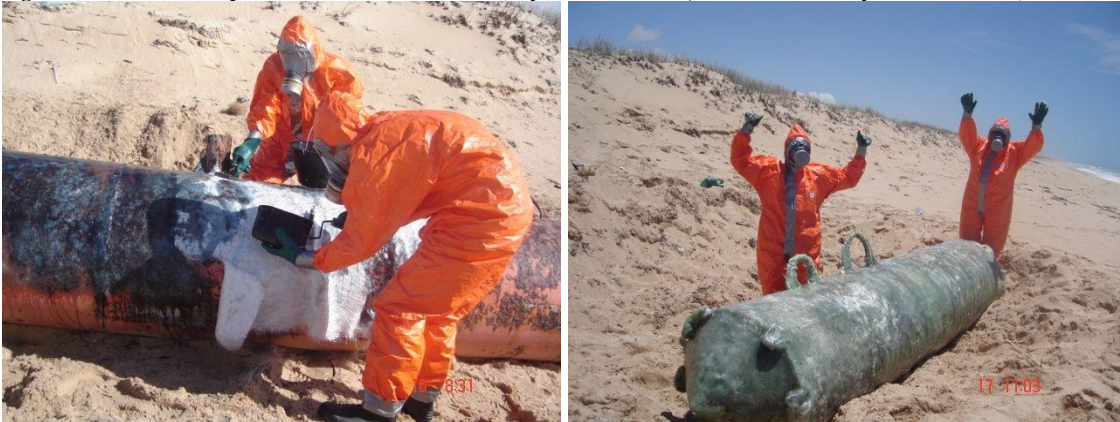
Figure 2. Some of the suspected toxic waste containers ( Daryeel Bulsho Guud, 2006. Published by Somalitalk.com )

In a report released in October 2000 by an Italian parliamentary commission it was indicated that, according to parliamentary hearings, Somalia has been for years and remains to be one of the preferred destinations for huge quantity of toxic wastes exported from Europe and other industrialized countries 9 . In addition, the report pointed out a “clear overlap” between the illicit transboundary traffic of toxic wastes and army smuggling into Somalia.